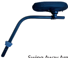
Swing Away Arms