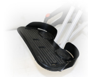
Standard Footbox Assembly