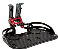
Flip Up Footbox Assembly