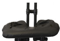
Standard Padded Footbox Assembly